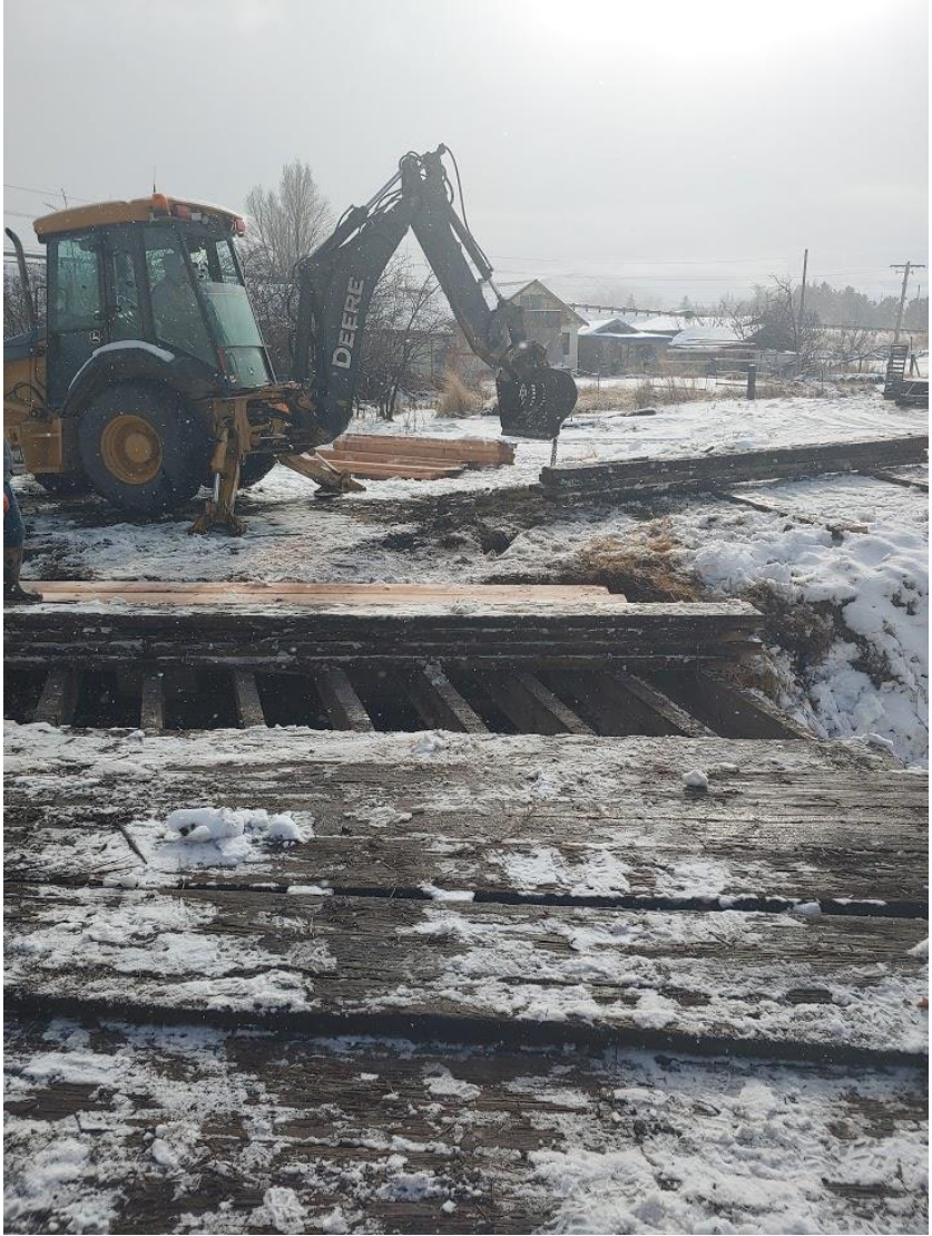
A-3 Crossing Repair