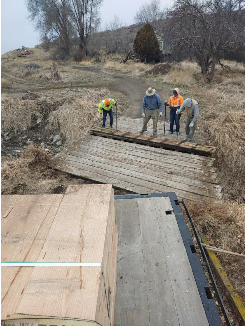
A-3 Crossing Repair