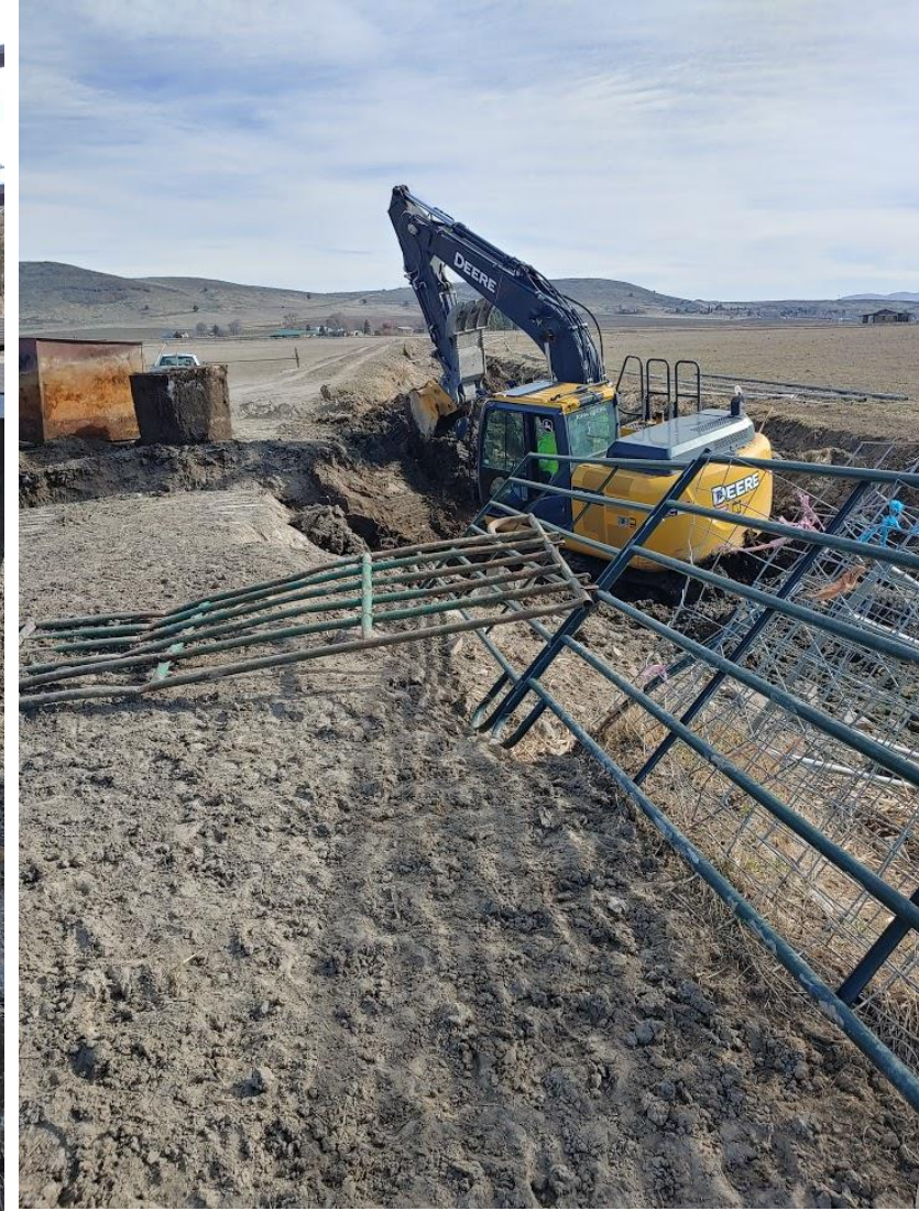
C4 Turnout Installation