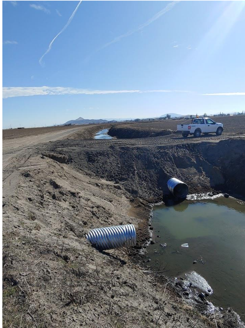
#8 Drain Crossing Repair