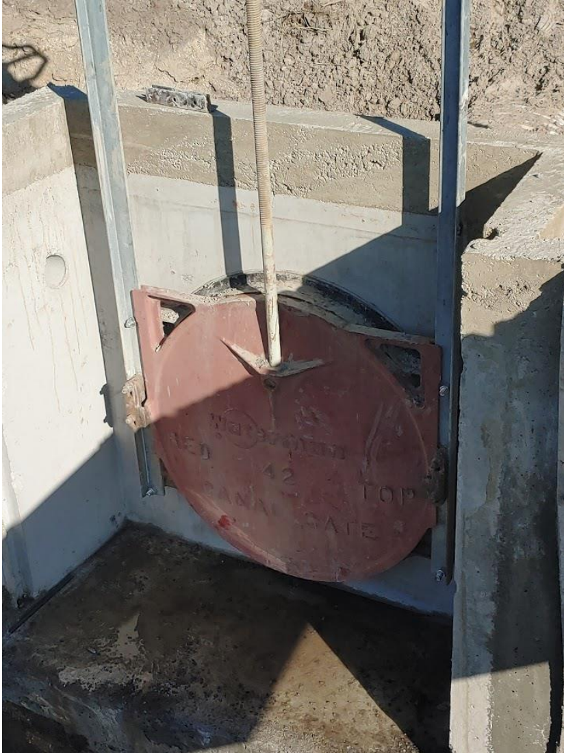
Pine Grove 42" Headgate