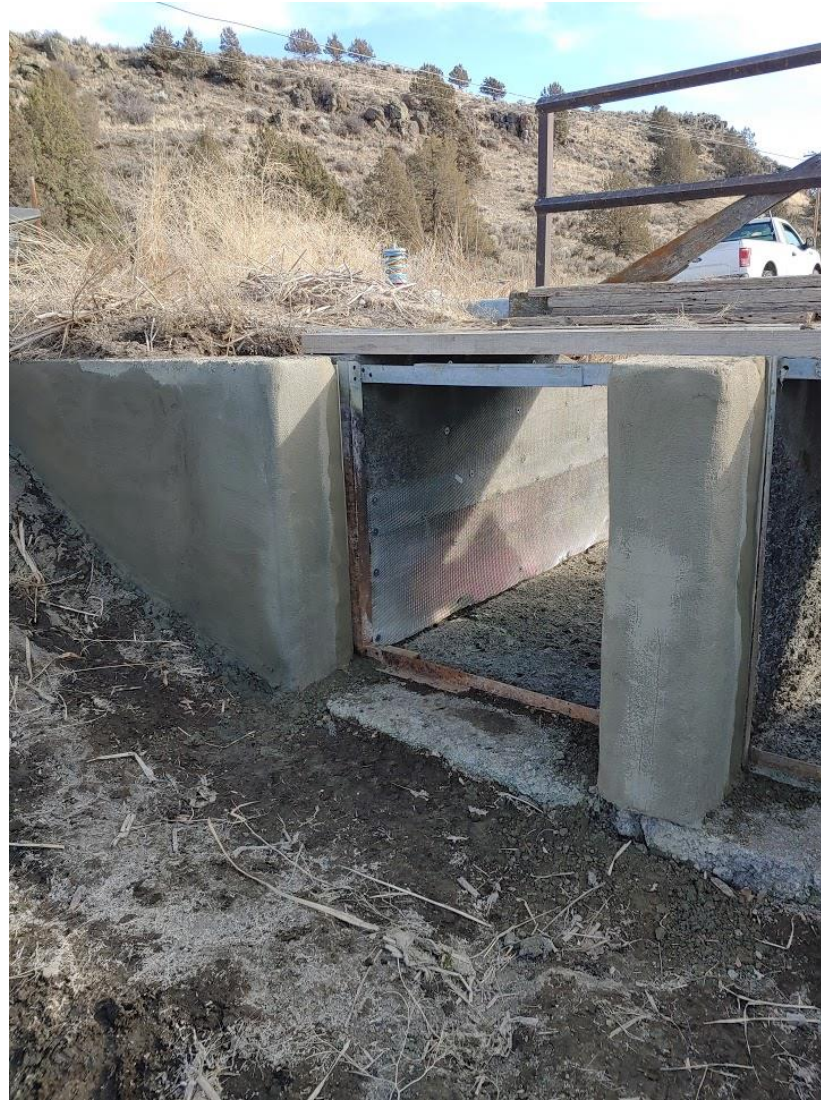
Zider Check Resurface