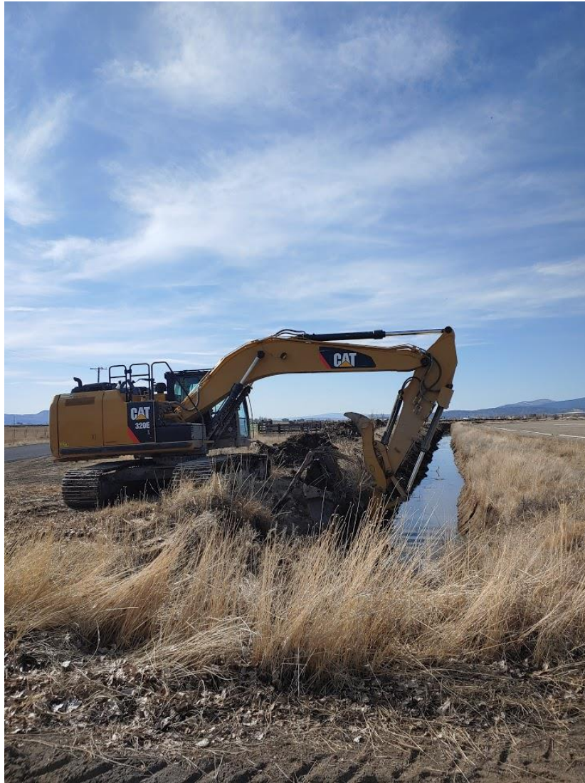
#11 Drain Cleaning