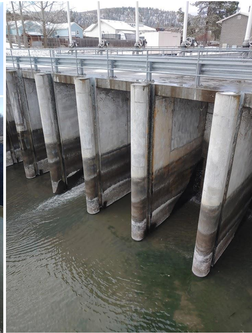
Initial Water-Up of A Canal Headworks (Equalization required before removing bulkheads to prevent damage)