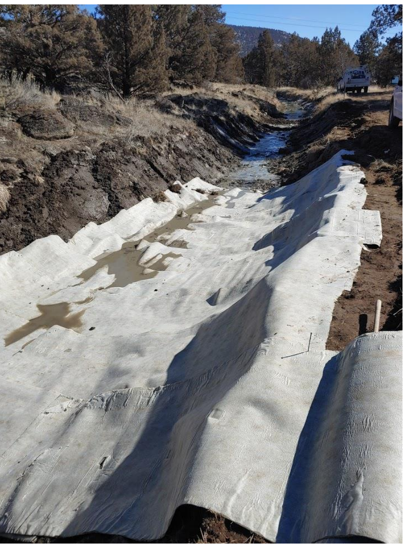
E Canal Liner at HWY 140