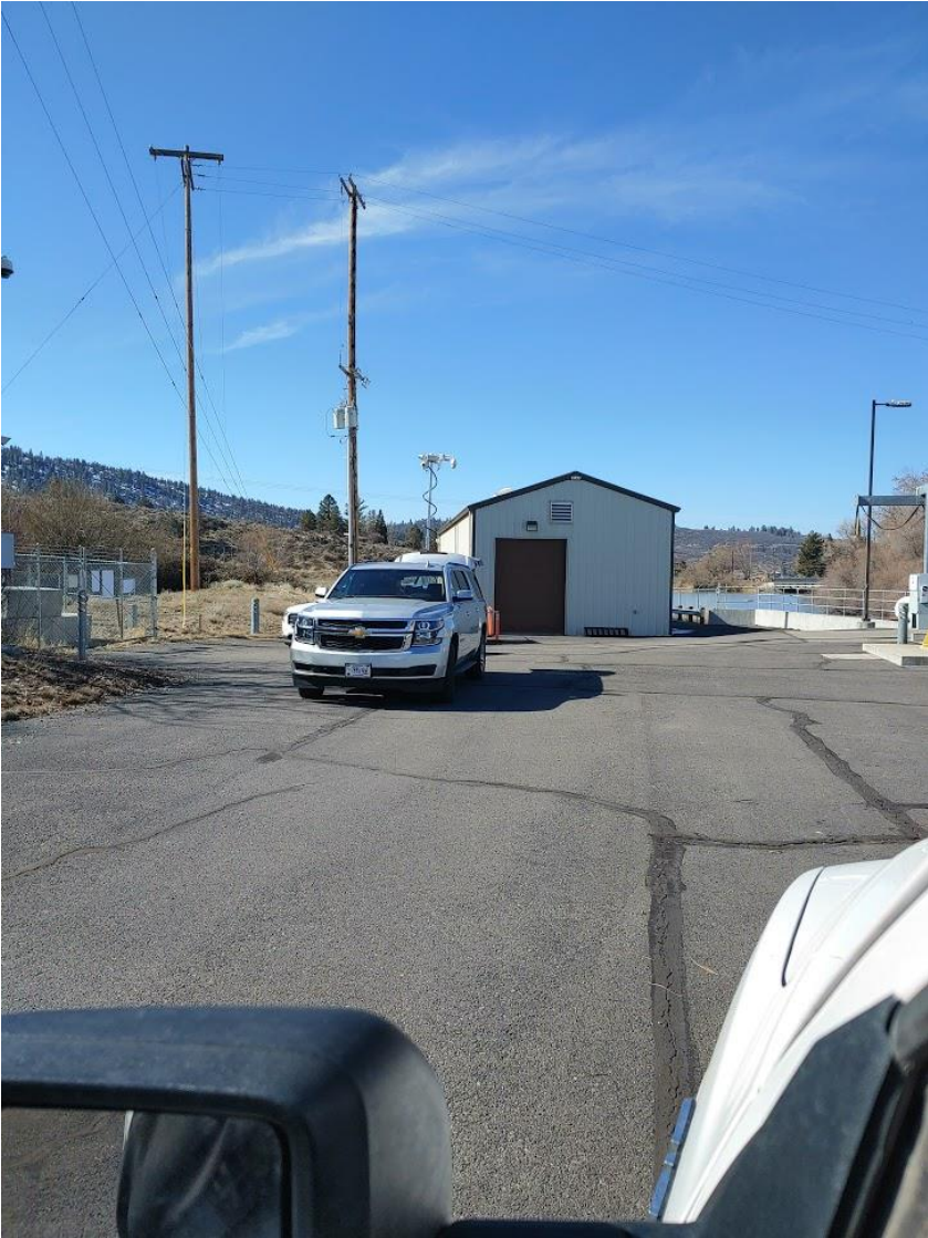
Reclamation Regional Security Upgrades