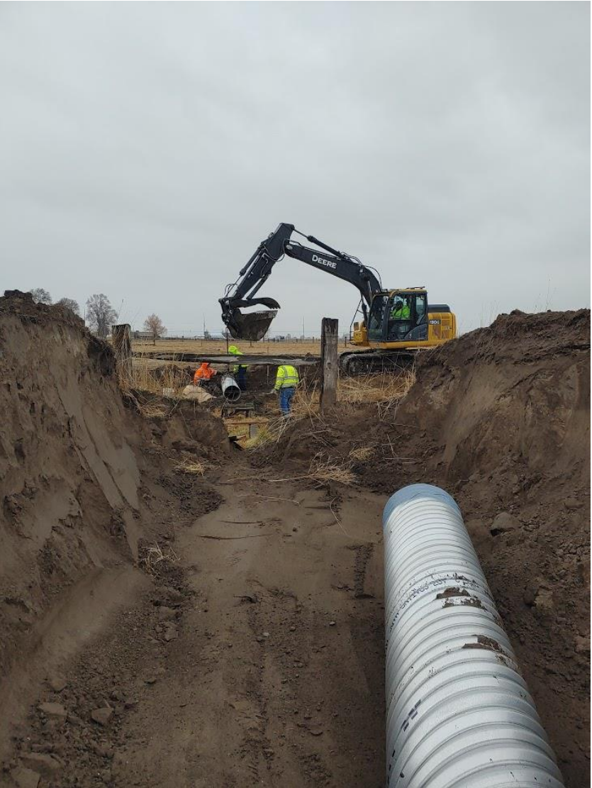
C –Siphon Spill Catwalk Installation